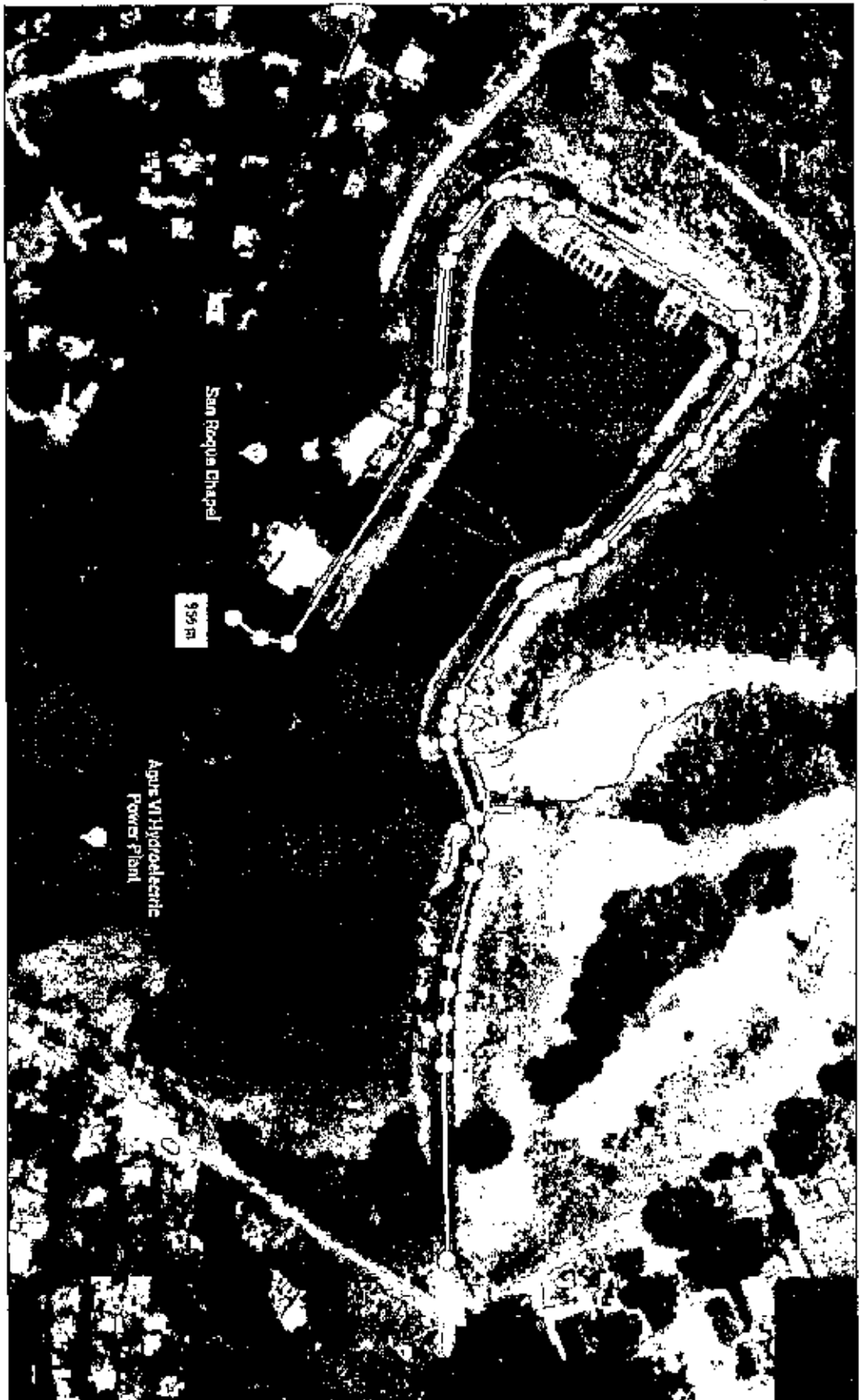
AGUS 6 DAM AERIAL VIEW Scale DNITS